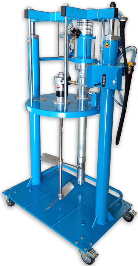
Feeding system for 200 liter drum Part no.: 0672650

The hardener is dosed undiluted and can be adjusted continuously.